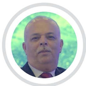
Mohamad Cheikhrouho General Rapporteur, Competition Council of Tunisia